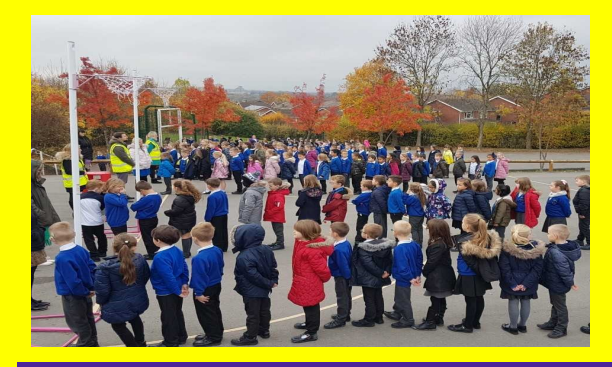
Remembering all those who lost their lives with a 2 minute silence.

Here at BLJS we wanted to mark the centenary of the First World War in a variety of ways. On Friday 9th November, Year 6 pupils visited the war memorial and the rest of the school held a 2 minute silence on the playground at 11.00 am.