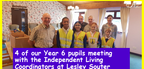
4 of our Year 6 pupils meeting with the Independent Living Coordinators at Lesley Souter House.

Thank you for your harvest contributions; we were overwhelmed by your generosity. Over the harvest week the children produced some fantastic pieces of art work; wrote some heart felt poems about nature and prayers which focused on thinking about others. During this time, the children decided that they would like to give their food collection to those less fortunate than themselves and chose supporting the elderly. On October 17th, staff and pupils delivered 6 large boxes of food produce to Lesley Souter House. At the house they met with the Independent Living Coordinators, who explained how the boxes will benefit the residents across Rugby. These being: Stretton Court, Lesley Souter House, Avon Court, Robotham Close, Pettiver Crescent and Duffy Place. Please look out for the children in the Rugby Advertiser.